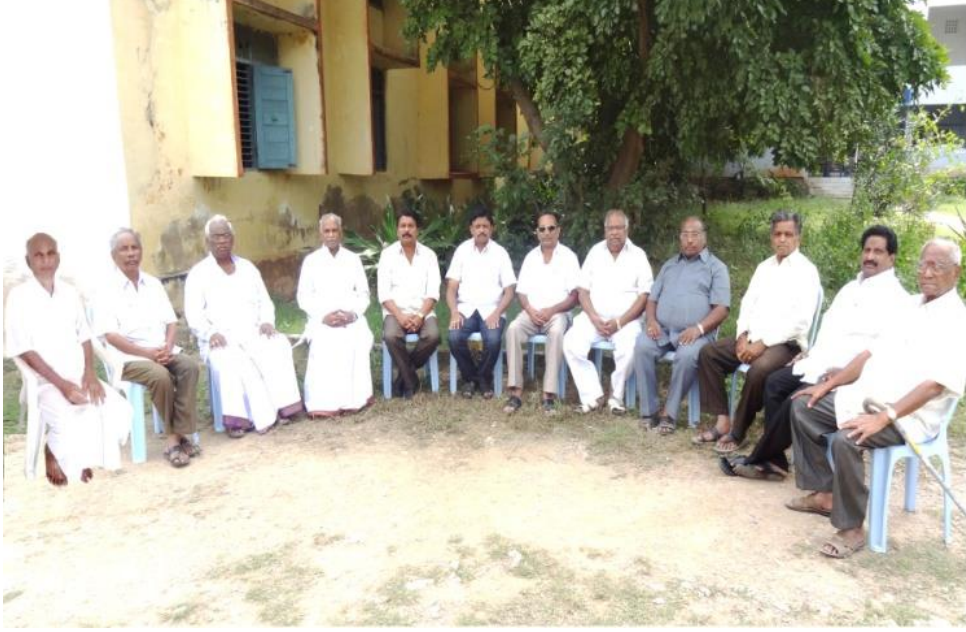
Sitting: L to R